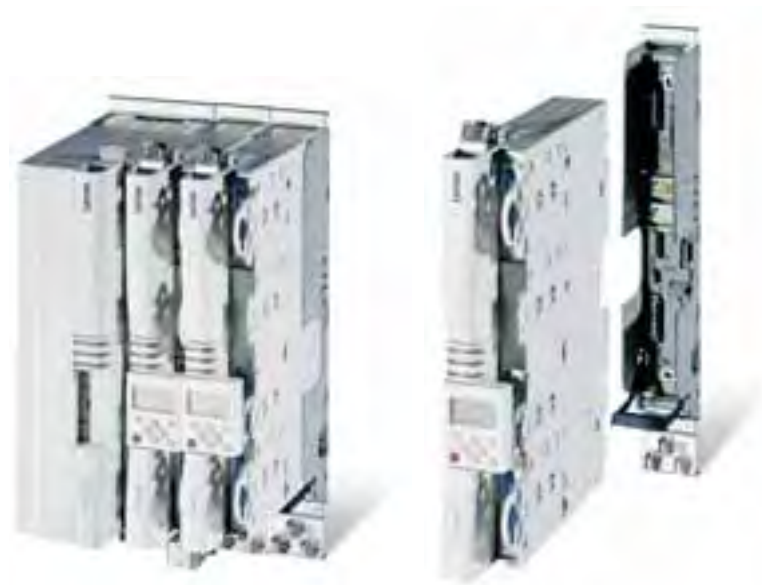
L-force 9400 StateLine Servo Drives

These drives comply with: Configurable technology applications DS402 / IEC 61800-7-2