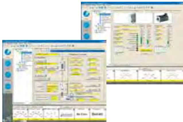
User interfaces in L-force Engineer