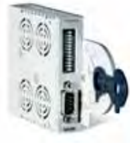
Extension module CANopen