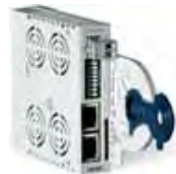
Extension module ETHERNET Powerlink*