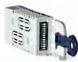
MM110 memory module

All equipment settings and application data are stored in a pluggable memory module. This means that, in the event of the hardware being replaced, for instance, it is only necessary to plug the memory module into the new device with a single click and the drive can be used again immediately.